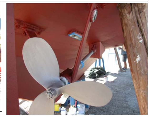
Views ashore October 2007